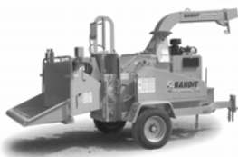
Bandit Chipper Model 1590X

A silent auction for the chipper, valued at $43,500, will be held at the Bandit booth on the Trade Show floor November 8 through 10, the with completion of bidding at the