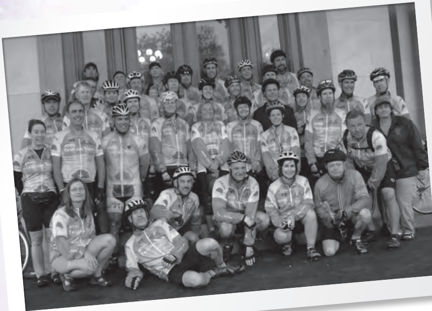
Cyclists of the 2009 STIHL Tour des Trees