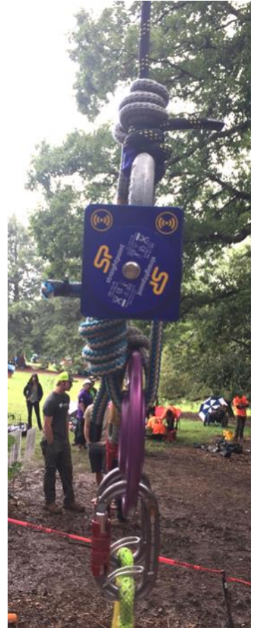
Figure 1 shows the Straightpoint LLC load cell used to measure forces during the Ascent event at the 2017 ITCC in Washington, DC.

force, and how frequently it's applied. The reason for this is because as its loaded by the ascending climber, the TIP bounces up and down. The interaction of the repeated application of peak loads with the natural tendency of the TIP to respond by bouncing may cause the effect of the force to be multiplied. This means that even if the peaks are well below the load-bearing capacity of the TIP, the bouncing action can increase the likelihood of failure.